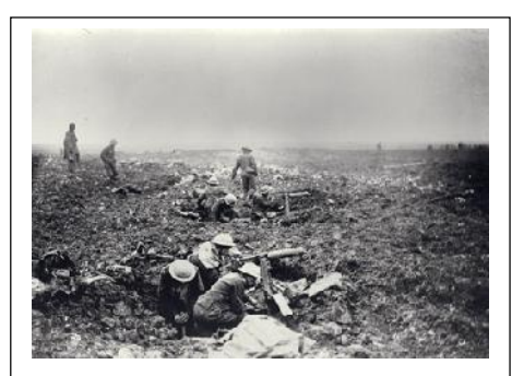
Canadian machine gunners dig themselves into shell holes on Vimy Ridge, France, April 1917.

When a newly promoted Canadian NCO [Sergeant] was told he could not walk down the streets with a Private [the lowest ranking soldier], he tore off his stripes. "I'm not a sergeant anymore," he declared. [A Canadian officer] came back from officers' school shaking his head over .... [as] an outcast from that group [because] "I am not a gentleman; I worked for the post office."