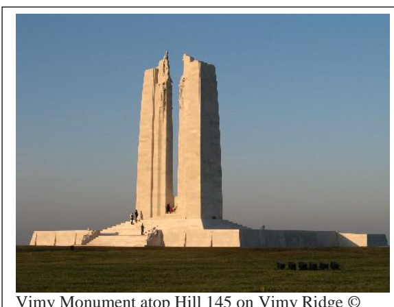
Vimy Monument atop Hill 145 on Vimy Ridge