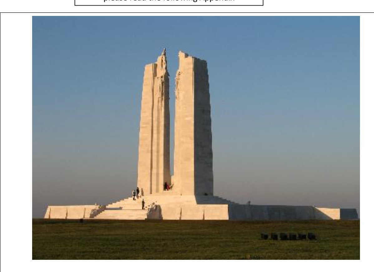
Vimy Monument atop Hill 145 on Vimy Ridge